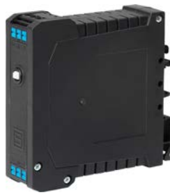
Housing RI with Circuit Breaker