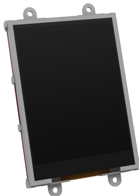
The uLCD-32-PTU Display Module