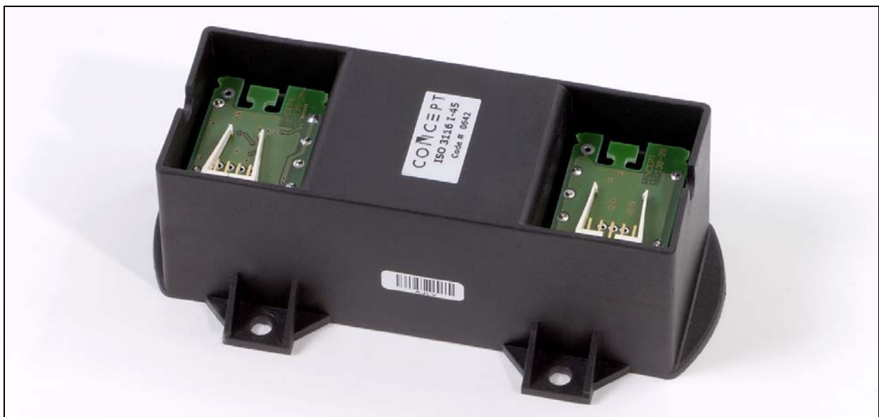
Fig. 1 Power Supply ISO3116I

For drivers adapted to various types of high-power and high-voltage IGBT modules, refer to www.IGBT-Driver.com/go/plug-and-play