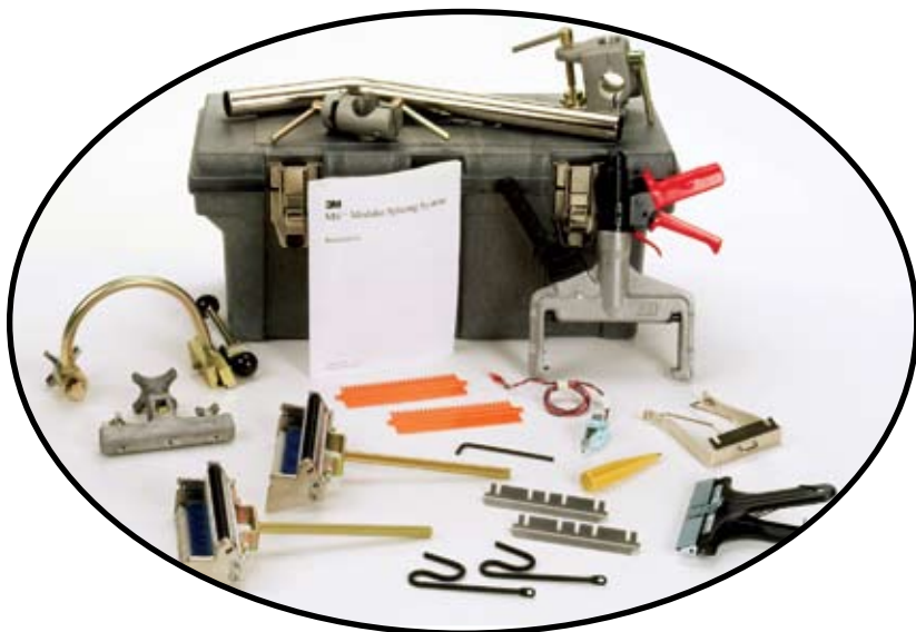
The 3M™ MS™ Splicing Rig 4045-K/36/FL/NXG is a versatile rig designed for one-person splicing. It allows maximum flexibility for difficult-to-reach areas and aerial applications.