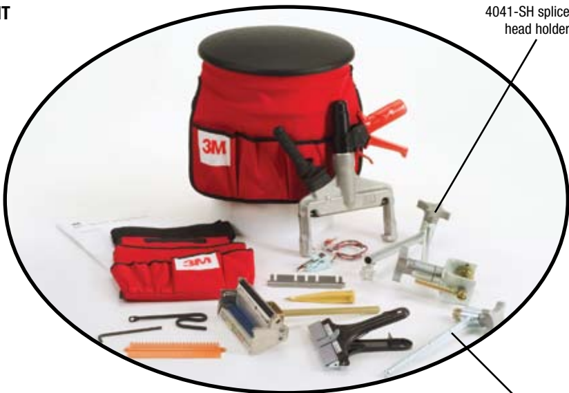
The 3M™ MS™ Splicing Rig 4049/NXG is a lightweight and portable splicing rig.