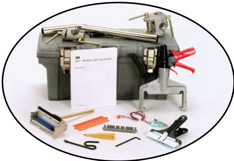
The 3M™ MS™ Universal Rig 4045-K/36/NXG is a versatile rig designed for one-person splicing in difficult-to-reach pedestal or rack areas.