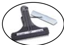
Separation Tool 4053-PM

Recommended for removing either bases or covers from 25-pair super-mini and covers only from 25-pair super-mate modules.