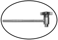
Variable Traverse Brace 4049-VTB

A module probe that permits one pair checking without damaging wire insulation. The prongs fit the test entry port of all MS 2 modules. The cord permits easy connection to a talk block or test set.