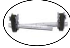
Split Support Tube 4046-CS

This assembly is designed to hold an MS 2 splicing head so it can be used in all applications.