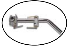
Universal Splicing Head Support Assembly 4045-SHSA

This assembly is designed to hold an MS 2 splicing head so it can be used in all applications.