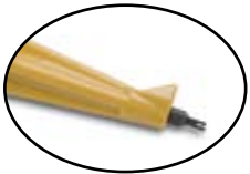
Wire Insertion and Cut-off Tool 4051

The 4049-VTB Variable Traverse Brace fits into the 4041-SH Splicing Head Holder and is designed to hold the MS 2 Splicing Head with Pedestal Support. It enables the user to position the MS 2 splice head where needed for greater splicing flexibility.