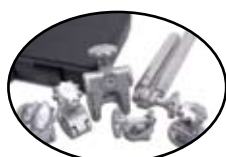
Tool Mounting Kit 3M710-TMK10-A

Used to plug up to seven super-mate modules together.