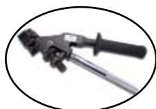
Hand Presser 4270-A

The only recommended tool to separate 4005-DPM/TR modules from any other module. Note: The 4053 cover removal tool cannot be used to separate DPM modules.