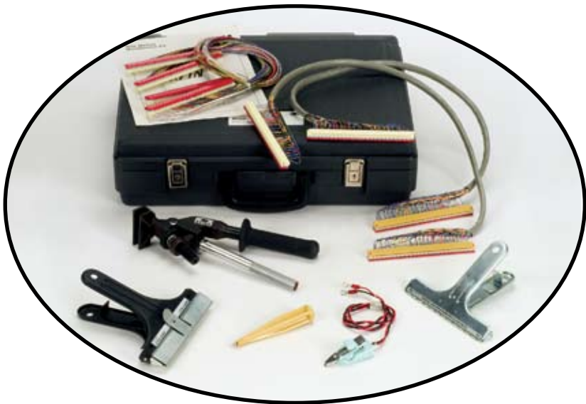
The 3M™ MS™ Module Maintenance Kit 4026-A contains the tools necessary for re-entry of super-mini and super-mate modules. The kit may be used for splice module combinations of two- through seven-way stackable splices.