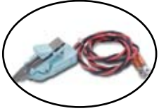
Pair Test Plug 4047

Collapsible for easy transport and setup.