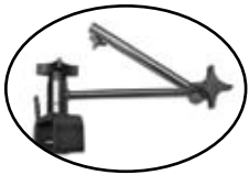
Splice Head Holder 4041-SH

Additional splicing head and "T" bar support for use with the MS 2 system.