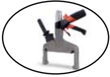
Hand Crimper 4036-25

Designed to hold a 4041-P splicing head in aerial splicing applications. Anchored to the suspension strand, the strand clamps behind and below the splice bundle and can be used with strands from 5 mm (3/16") diameter to 10 mm (3/8").