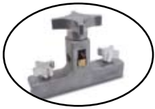
Support Vise 4025

Used to mount the 4040 splicing head assembly in tight situations.