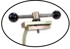
Aerial Strand Clamp 4035-A

Lightweight and hand-operated. When proper crimping pressure is reached, a bypass valve opens.