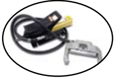
Air/Hydraulic Crimping Unit 4030

Durable, easy to transport tool box with tray. 66 x 29.2 x 28.2 cm (26 x 11.5 x 11.1") Cube: 9.8 kg. (21.7 lbs.) Ctn. size: 67.1 x 30 x 58.4 cm (26.4 x 11.8 x 23")