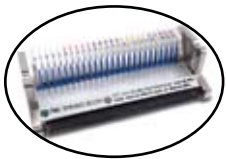
Splice Head 4041-SPL

The 4041-SH is the tool mounting assembly from the 4049-NXG and 4049-R Lite Rigs that holds the 4049-VTB Variable Traverse Brace. It enables the user to position the MS 2 splice head where needed for greater splicing flexibility.