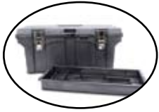
Tool Box with Modified Tray 4028-A

Used to mount the 4040 splicing head assembly in tight situations.