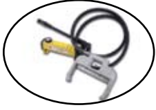
Hand/Hydraulic Crimping Unit 4031

Designed for high-volume module termination and uses air or nitrogen supply. An air cylinder or compressor with output pressure of 6.33–7.03 kg/cm (90–100 PSI) must be used. The unit is either hand- or foot-operated.