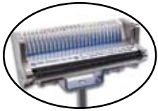
Splicing Head and "T" Bar 4041-P

This assembly contains a splicing head, a pedestal, a traverse clamp assembly with a long bar, and a head clamp for use with two-man fold-back splicing.