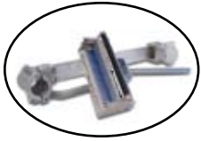
Splicing Head Assembly 4040

A self-contained, pistol-gripped crimper designed to crimp MS 2 modules in the 4041 splicing head.