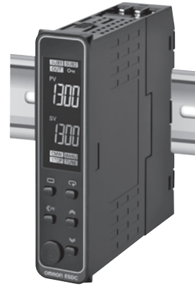
22.5 mm Wide, and DIN Track-mounting Type E5DC

Refer to your OMRON website for the most recent information on applicable safety standards.