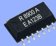
RX8900SA (10.1 × 7.4 × 3.3 mm)