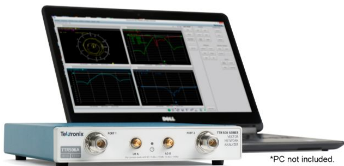
*PC not included.

An independent RF source and three RF receivers for each port of the TTR500 enable you to take high-accuracy magnitude and phase measurements with a 1-port or 2-port device under test (DUT). Use the TTR500 to perform complete S_{11} , S_{12} , S_{21} , and S_{22} measurements of the DUT and display data in a variety of formats (see measurement functionality table).