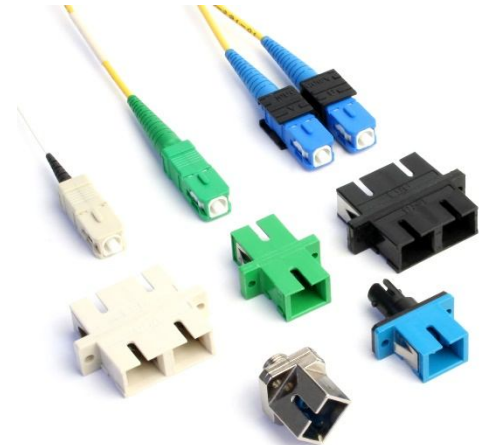
Multiple Options on SC Adapters