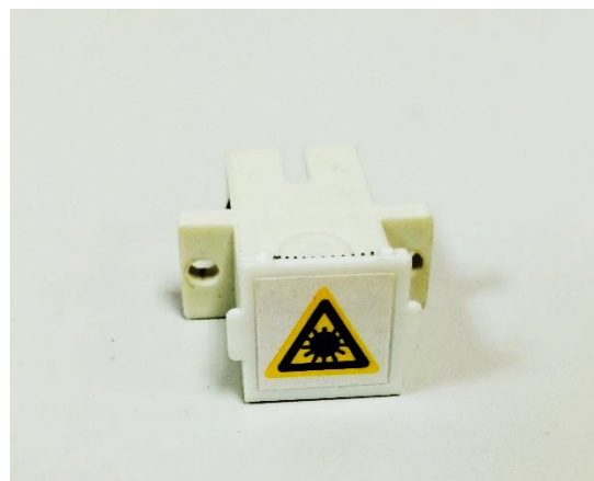
SC External Shuttered Adapters