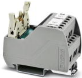
VARIOfACE Professional (VIP) board for the ROC800 controller

Please be informed that the data shown in this PDF Document is generated from our Online Catalog. Please find the complete data in the user's documentation. Our General Terms of Use for Downloads are valid ( http://phoenixcontact.com/download )