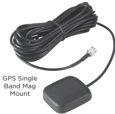
GPS Single Band Mag Mount