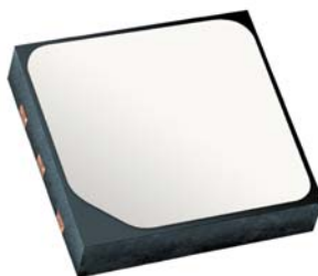
Figure 7. Si7021 with Factory-Installed Protective Cover

*Note: All trademarks are the property of their respective owners.