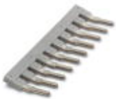
Insertion bridge, Number of positions: 10, Color: gray