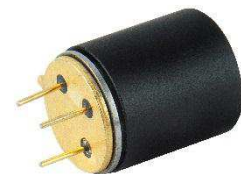
Isolating Cover Option

Examples; 805M1-0020 Model 805M1, 20g range