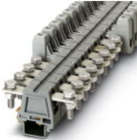
Universal terminal block with bolt connection, cross section: 6 - 25 mm 2 , AWG: 10 - 4, width: 26 mm, color: Gray

Please be informed that the data shown in this PDF Document is generated from our Online Catalog. Please find the complete data in the user's documentation. Our General Terms of Use for Downloads are valid ( http://download.phoenixcontact.com )