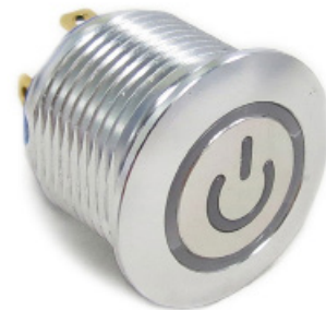
Part Number 2316366-1