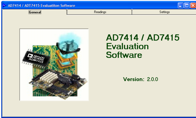
Figure 7. AD7414/AD7415 Found

If the evaluation board is not found, the following message will appear: