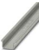
DIN rail, material: Steel, unperforated, 2.3 mm thick, height 15 mm, width 35 mm, length: 2 m

DIN rail - NS 35/15-2,3 UNPERF 2000MM - 1201798