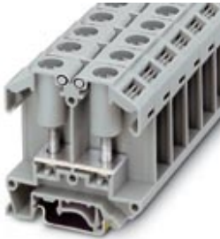
Universal terminal block with bolt connection, cross section: 1 - 25 mm 2 , width: 18 mm, color: gray

Please be informed that the data shown in this PDF Document is generated from our Online Catalog. Please find the complete data in the user's documentation. Our General Terms of Use for Downloads are valid ( http://download.phoenixcontact.com )