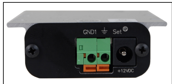
Figure 2. Rear view of Wrist Strap and Ground Monitor

Attach 18 AWG wires to the unit as described below. Strip back the vinyl insulation at each end of the wires to approximately 1/3 inch (8 mm). Twist the stranded wire on each end before inserting the wire into each connector location. In order to attach the wire, insert a small blade screwdriver into the orange slot above. Gently push inward and insert the stripped wire fully into the hole in the green connector. Hold the wire fully in and release the screwdriver to allow the wire to catch. Attach the green monitor ground cord to the ground connector on back of unit. Attach the impedance monitor wire to the “GND1” connector on the back of the unit.