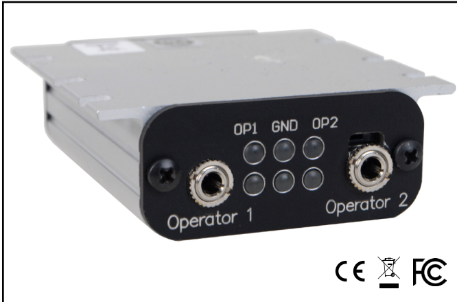
Figure 1. SCS CTC337 Wrist Strap and Ground Monitor