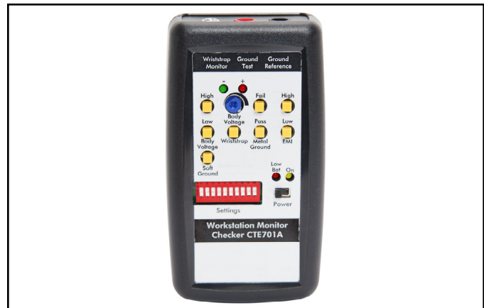
Figure 3. SCS CTE701 Workstation Monitor Checker

The checker verifies the proper operation of dual wrist strap monitoring. Connect a 3.5 mm test cable to both the checker and to the operator jack of the monitor. At this point the monitor should indicate failure. Depress the Pass button on the wrist strap section. The monitor should indicate a good connection. While pressing the Pass button, press body voltage “high.” At this point the Wrist Strap LED would be blinking red.