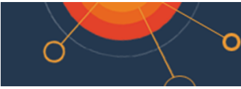
Maßbild Nr. 2