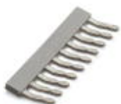
Insertion bridge, Number of positions: 10, Color: gray