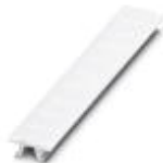
Zack marker strip, Strip, white, Labeled according to customer specifications, Mounting type: Snap into tall marker groove, For terminal block width: 6.2 mm, Lettering field: 6.15 x 10.5 mm