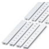
Zack marker strip, white, For terminal block width: 10 mm

Zack marker strip - ZB10:SO/CMS - 1050525