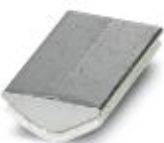
Insertion profile, Color: silver