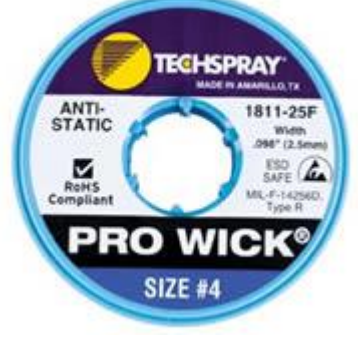
1813-5F Pro Wick Red #6 Braid - AS 5' 25 units/case