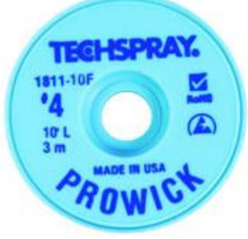
1812-5F Pro Wick Brown #5 Braid - AS 5' 25 units/case