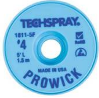
1811-100F Pro Wick Blue #4 Braid - AS 100' 1 units/case