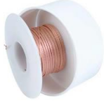
1809-25F Pro Wick Yellow #2 Braid - AS 25' 1 units/case