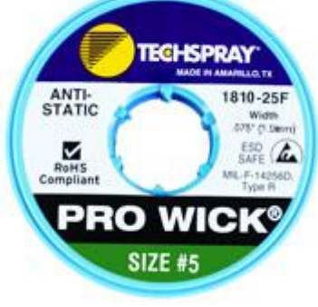
1811-10F Pro Wick Blue #4 Braid - AS 10' 25 units/case