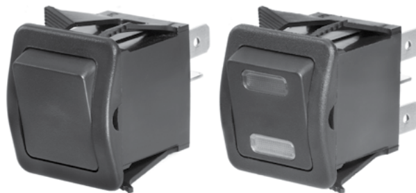
K2 Series Single & Double Pole