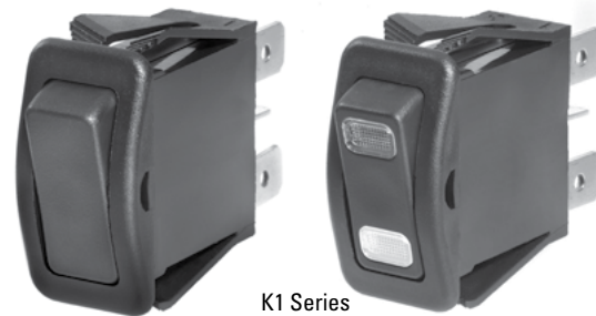
K1 Series Single Pole

OTTO can provide custom colors upon request. Value-added assemblies with wire leads are also available. Please consult the factory for assistance.