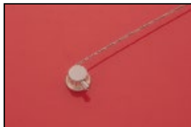
Step 4 - Crimp & Cut

The ferrule is firmly crimped and the cable is cut flush with the end of the ferrule.