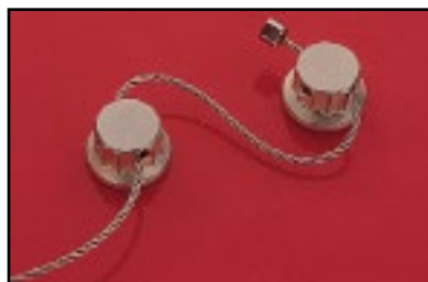
Step 1 - Thread

A cable assembly is threaded through the fasteners in a direction that exerts a positive pull on the fastener when tension is applied.