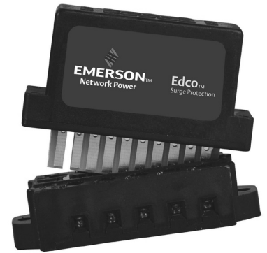
EDCO PCB1B-WKEY BASE SOLD SEPARATELY

The Edco PC642 card edge is gold-plated, double sided and is designed to mate with the Edco PCB1B-WKEY gold-plated female terminal connector (sold separately). When snapped together, the data circuits “pass thru” the protector in a serial fashion from the four “Field Side” terminals to the four “Electronics Side” terminals. Terminals 1 or 10 of the PCB1B must be attached to Building-Approved Ground.