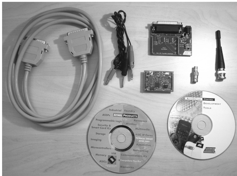
Figure 2-1. Kit Contents

The transceiver kit consists of a transceiver base station board, an SPI2LPT interface board, a DC supply cable, a parallel port cable, and a CD-ROM with the appropriate software, as depicted in Figure 2-1. The transceiver board and the SPI2LPT interface board have to be ordered separately.