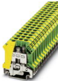
Ground terminal block with screw connection, cross section: 0.5 - 6 mm 2 , AWG: 20 - 8, width: 8.2 mm, color: green-yellow

Please be informed that the data shown in this PDF Document is generated from our Online Catalog. Please find the complete data in the user's documentation. Our General Terms of Use for Downloads are valid ( http://download.phoenixcontact.com )