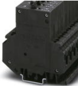
Thermomagnetic circuit breaker, 1-pos., fast blow, 1 N/O contact, with universal foot for mounting on NS 32 or NS 35

Please be informed that the data shown in this PDF Document is generated from our Online Catalog. Please find the complete data in the user's documentation. Our General Terms of Use for Downloads are valid ( http://download.phoenixcontact.com )