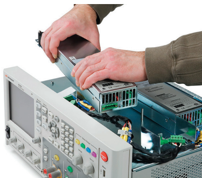
Figure 2. DC power modules are easily installed into the N6705 DC power analyzer mainframe.