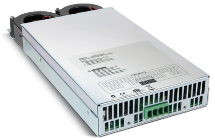
Figure 16. The N6750 high-performance series and N6760 precision series DC power modules that are \geq 300 W each occupy two modules slots within the mainframe. All other modules occupy one module slot.

www.keysight.com/find/N6783A-BAT www.keysight.com/find/N6783A-MFG and download the N6783A-BAT Data Sheet , 5990-8662EN and the N6783A-MFG Data Sheet , 5990-8643EN.