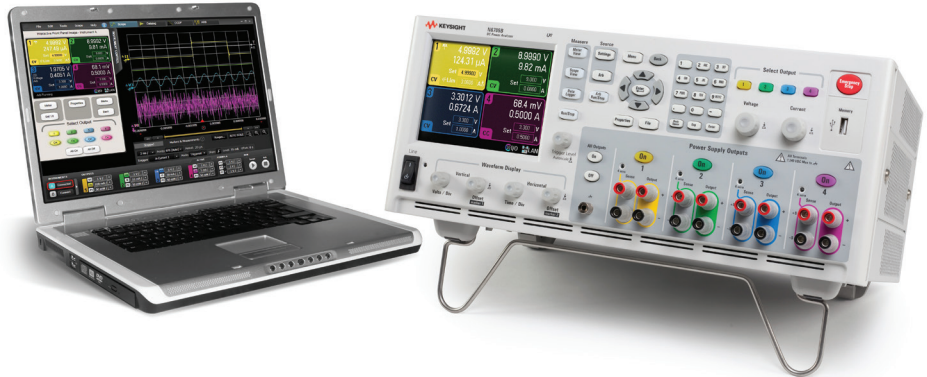
Figure 1. The Keysight N6705 DC power analyzer with 14585A software.

Each DC power module output is fully isolated and floating from ground and from each other.