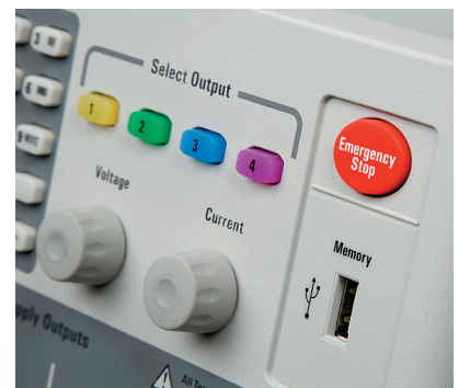
Figure 13. The emergency stop button shuts down all outputs immediately.