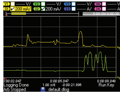
Figure 6. In Data Logger View, you can log data on multiple traces. Here, the current flowing out of output 1 and output 2 are captured over 30 seconds.

The maximum data log file size is ~2 gigabytes, which is approximately one billion readings. The data file can be stored on the N6705's internal non-volatile RAM or saved externally on a USB memory device.