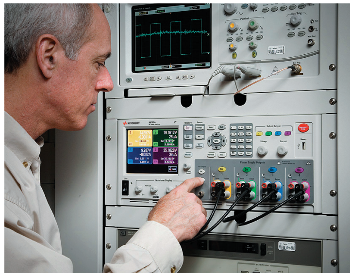
Figure 14. The Keysight N6705 can be installed in a standard 19 inch rack.

The Keysight N6705 has a universal input that operates from 100-240 VAC, 50/60/400 Hz. There are no switches to set or fuses to change when switching from one voltage standard to another. The AC input employs power factor correction.