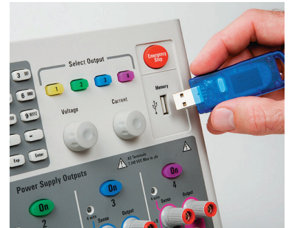
Figure 12. The N6705's front panel USB port.

Note: Output current is limited on some modules when option 760 Output Disconnect/Polarity Reversal Relays is installed. See the “Available options” tables on page 21 for more information about maximum current limitations with option 760.