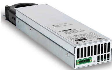
Figure 15. The basic series.

The Keysight N6750 series of high-performance, autoranging DC power modules provide low noise, high accuracy, and output voltage changes that are up to 10 to 50 times faster than other power supplies. Additionally, autoranging output capabilities enable one power supply to do the job of several traditional power supplies.