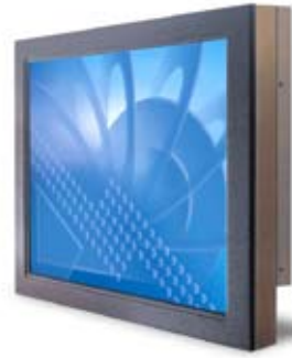
With optional Slimline Bezel (Part Number: 2709122)