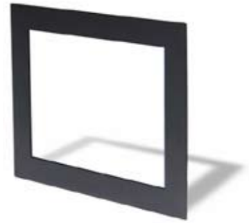
Optional Industrial Flange Bezel (Part Number: 5021104)