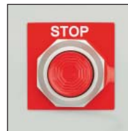
Raised Panel Labels