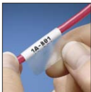
Wire and Cable Marking