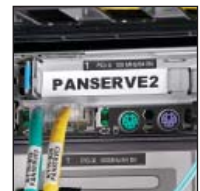
Network Infrastructure Labeling