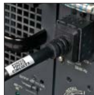
Electrical Infrastructure Labeling