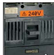
Electrical Hazard Labels