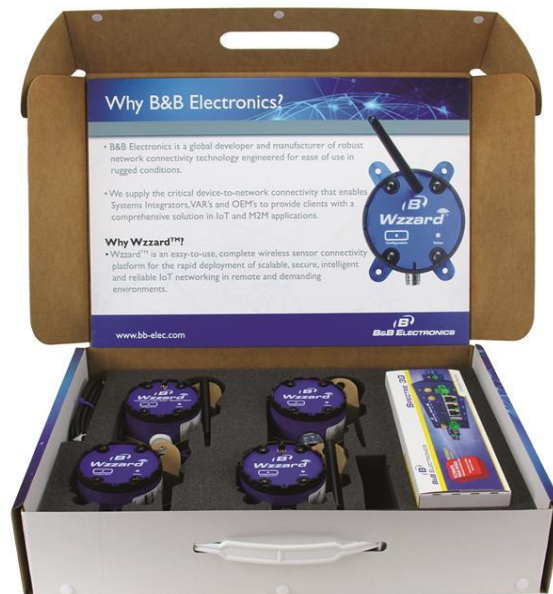
Figure 1. Wzzard Development Kit

B&B has preselected the contents of the design and development kits. One provides cellular and Ethernet network connections. The other provides an Ethernet network connection. The kits include a Spectre Network Gateway, and M12 cable and (4) Intelligent Edge Nodes. (Additional Nodes may be purchased to build a larger network). The Nodes provide the sensor interface connection to all of the options provided by the Wzzard system; analog input, digital input, integrated accelerometer and thermocouple input. All Nodes also contain an integrated temperature sensor. Nodes have multiple cabling options: conduit fitting and M12 connections. Additionally, two of the Nodes are supplied with external antennas and two with internal antennas, allowing you to test for range with both options. Kit contents are described below: