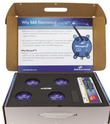
Figure 2. Package Contents

The Wzzard Design and Development Kits come in an enclosure. The contents of the package are shown below: