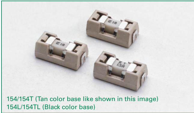
154/154T (Tan color base like shown in this image) 154L/154TL (Black color base)