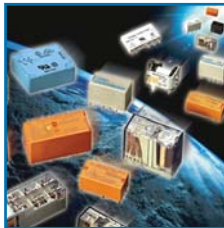
Schrack PCB Relays