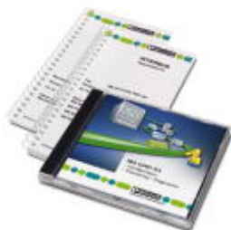
Network configuration software for INTERBUS Generation 4

Please be informed that the data shown in this PDF Document is generated from our Online Catalog. Please find the complete data in the user's documentation. Our General Terms of Use for Downloads are valid ( http://phoenixcontact.com/download )