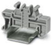
Quick mounting end clamp for NS 35/7,5 DIN rail or NS 35/15 DIN rail, with marking option, width: 9.5 mm, color: gray