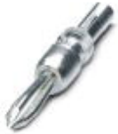
Test plugs, Color: silver