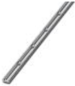
Cross connection rail, for fixed bridging of identical inputs and outputs, made of Cu, nickel-plated, 1 m long