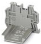
Quick mounting end clamp for NS 35/7,5 DIN rail or NS 35/15 DIN rail, with marking option, with parking option for FBS...5, FBS...6, KSS 5, KSS 6, width: 5.15 mm, color: gray