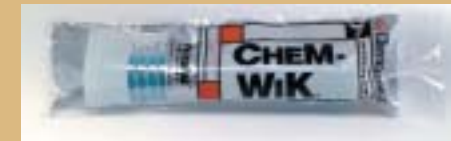
PermaPak™ Barrier Packaging contains 25 bobbins per package