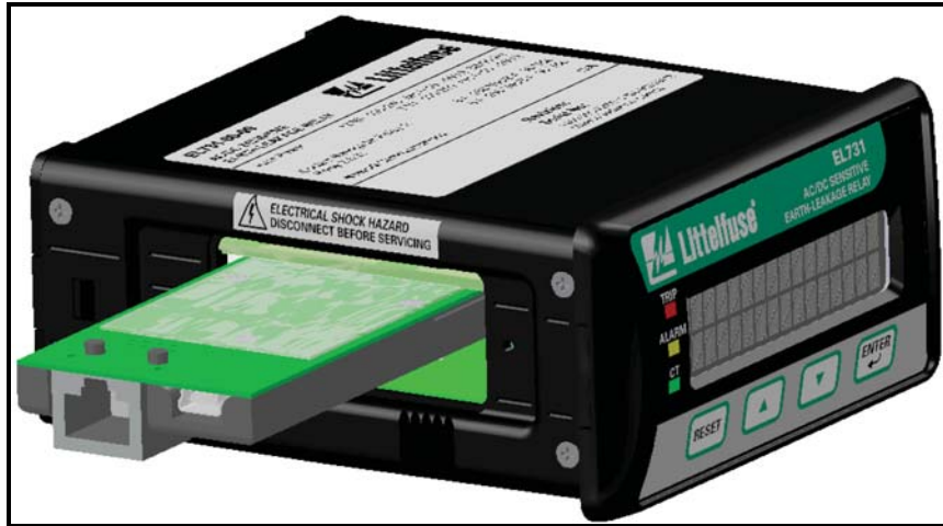
FIGURE 3. Firmware Upgrade Module (AC700-CUA-00) installed in an EL731.