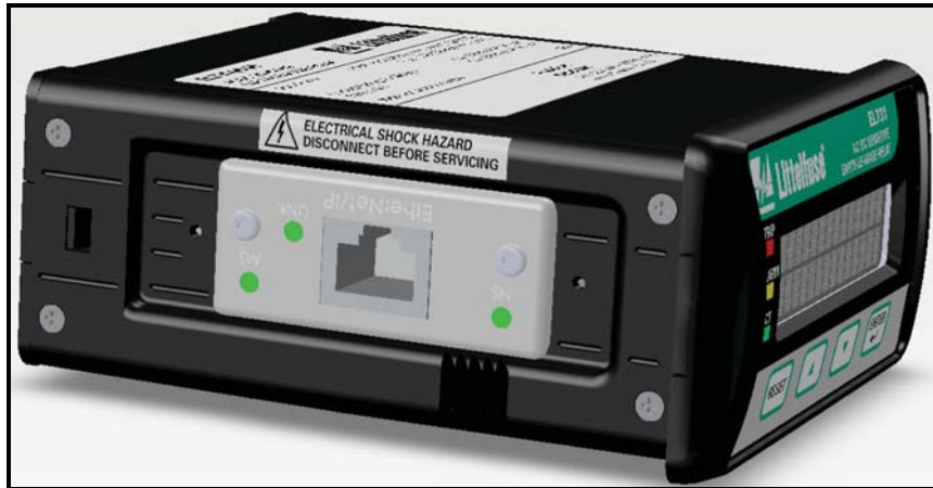
FIGURE 4. Ethernet/IP Communications Module (AC700-CUA-03) installed in an EL731.