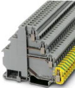
Sensor/actuator terminal block, Cross section: 0.2 mm 2 - 4 mm 2 , AWG: 24 - 12, Connection type: Screw connection, Width: 6.2 mm, Color: blue, Mounting type: NS 35/7,5, NS 35/15

Please be informed that the data shown in this PDF Document is generated from our Online Catalog. Please find the complete data in the user's documentation. Our General Terms of Use for Downloads are valid ( http://download.phoenixcontact.com )