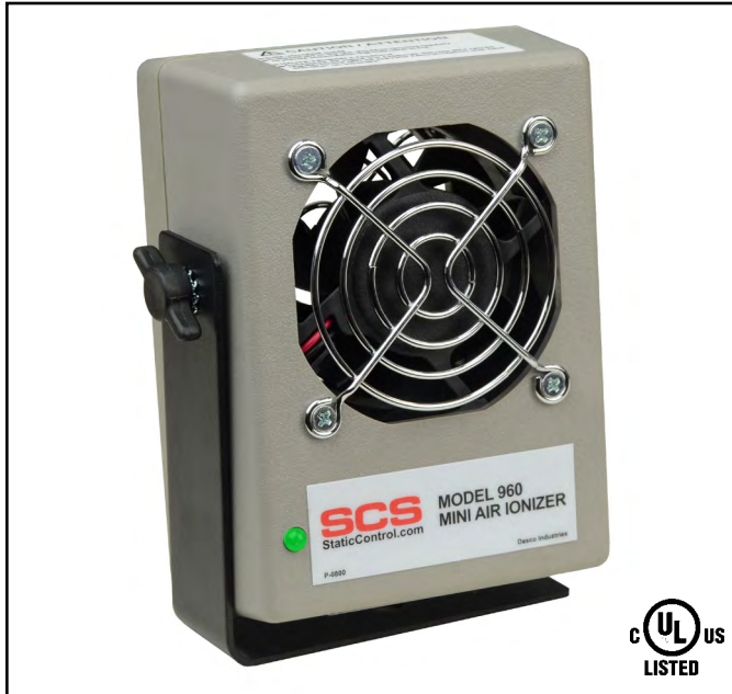
Figure 1. SCS 960 Mini Air Ionizer