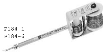
Shows stripping action of Slit-N-Wrap process.

Unwraps #26 thru #30 gage wire manually. Outer spring loaded sleeve retains wire after unwrapping and ejects wire. The unwrapping bit is recessed far enough into the sleeve to permit unwrapping more than the maximum amount of turns needed on .025" square wrap posts. Bit included.