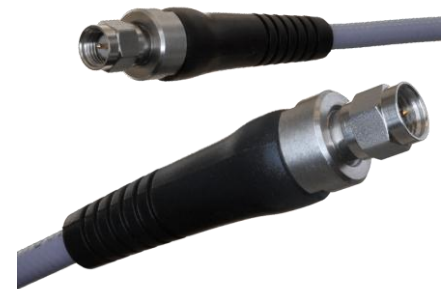
DKT Cable Assembly SMA Male Straight to SMA Male Straight HP190S Cable