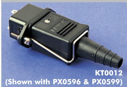
KT0012 (Shown with PX0596 & PX0599)