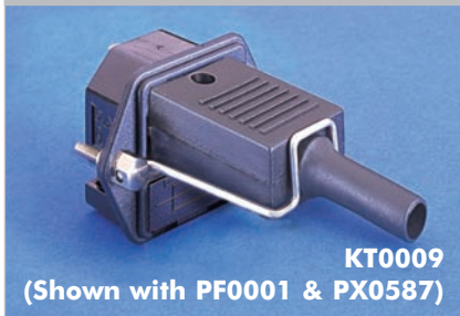
KT0009 (Shown with PF0001 & PX0587)