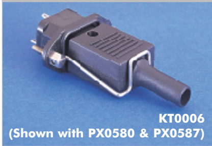
KT0006 (Shown with PX0580 & PX0587)