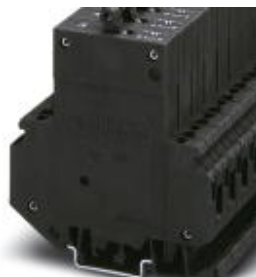
Thermomagnetic circuit breaker, 1-pos., fast blow, 1 N/C contact, with universal foot for mounting on NS 32 or NS 35

Please be informed that the data shown in this PDF Document is generated from our Online Catalog. Please find the complete data in the user's documentation. Our General Terms of Use for Downloads are valid ( http://download.phoenixcontact.com )