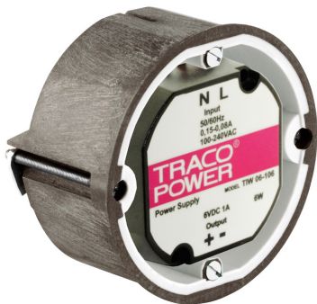
(Mounted in standard flush box)

The TIW series is a new range of small size DC-power supplies which have been designed particularly for applications in home and office installations.