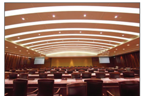
LED panel-lighting applications