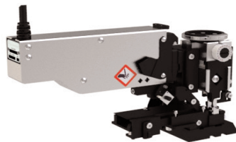
Pacific-Style SF Servo