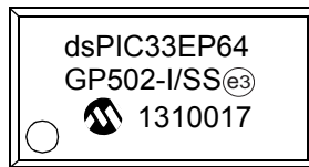
28-Lead QFN-S (6x6x0.9 mm)